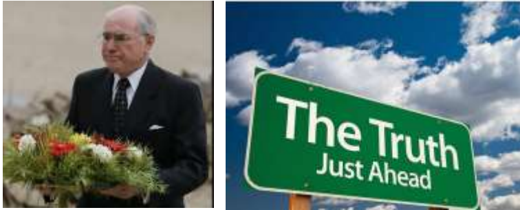
(L) PM John Howard at Port Arthur

All the chapters of Part One have reported some dishonesty. We are a dishonest species; it is all part of self-preservation, and getting ahead. But it has to be slowed down. Unfortunately, humans can live with amazing dissonance. We can say the best interest of the child is paramount, and proceed to act as if it were the least important factor.