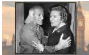
Savile and Thatcher