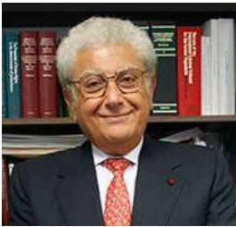
Law Professor Cherif Bassiouni

I know you want me to tell you the official words to use. Don’t be silly. Forget officialness. Think purpose. The purpose is: SOCIETY enforces the discipline, the rules. It is society’s job and at that moment you are society. Even if a lady’s stealing your bike and you stop her you are doing it for society although it may look selfishly motivated.