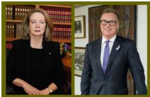
(L) Susan Kiefel, Chief Justice of Australia (R) William Alstergren, Chief Justice of the Family Court