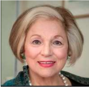
The Honorable Franca Arena, b 1939, Italy, Member of the New South Wales Legislative Council from 1981, first for the Labor Party then as an Independent from 1997 until 1999

In NSW in 1997 Franca Arena had suggested that the premier and the leader of the opposition conspired with Justice Wood in his role as Royal Commissioner about police protection of pedophiles .