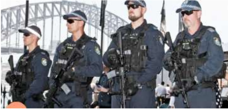
NSW Police carried M4 rifles on New Year's Eve.