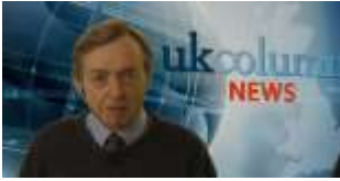
A daily online news show, non-MSM