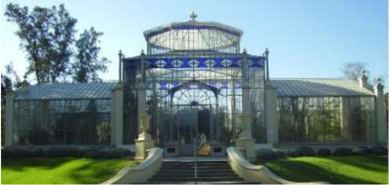
Palm House in Adelaide's Botanic Gardens

Part Four, “The Bigger Picture” will now attempt to put the subject of legal kidnap into a context. I see it as part of a social engineering. This will be described in five chapters: