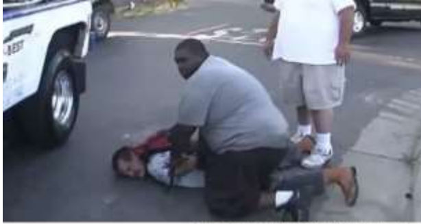
Allegedly a citizen's arrest in Oklahoma

First, the violent arrest shown in the picture is not the kind we'll be discussing here. Second, note that in the term "citizen's arrest," the apostrophe goes before the S. It is the proper spelling – you could say "official" spelling. So what is the meaning of official anyway? The Olympics, which is a private organization, has "official" insignias. The queen's "official" birthday is other than her real one. Don't worry about the officialness of citizen's arrest, please. Worry about its purpose. The purpose is to help society.