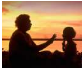
Bringing Them Home Report, 1997