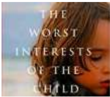
Cover of Keith Snow's invaluable 2015 book

Clearly the players are all in on it. Anyone can see that the normal thing, per the values of our society, would be to apply the above “desist notices.” The reason that the child abuse epidemic, worldwide, must be that it is carefully engineered. On the next two pages please find my review of Snow’s book The Worst Interests of the Child that shows US “child protection” people to be behaving exactly like those in Australia. Exactly.