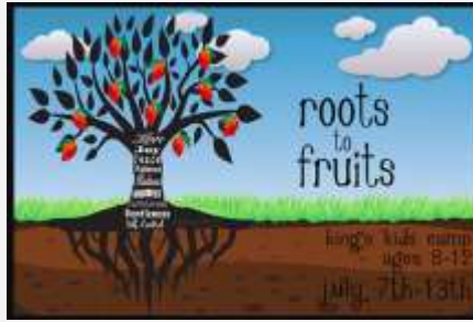
A camp at St Croix

The poster is an ad for a children's camp in Virgin Islands. The reference is to the New Testament, Galatians 5:22 –