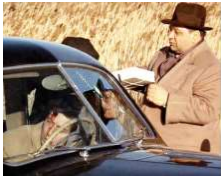
(L) Sir William Blackstone, author of Commentaries on the Laws of England, (R) After the take-the-cannoli's scene in The Godfather

This penultimate chapter asks whether law is worth saving or whether we should just agree to let it all collapse.