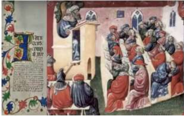
Picture of a law school lecture, manuscript in St John's College

A mum called to ask me if she can refuse to give back the child to the pedo father at the end of her current 2-week visit. I'm not a practicing attorney, but I'm not an idiot. I know that 2 and 2 make four, that the sun rises in the east, and that the capital of Florida is Tallahassee. And naturally I know that a parent does not have to hand a child over to a person who is almost certain to harm that child.