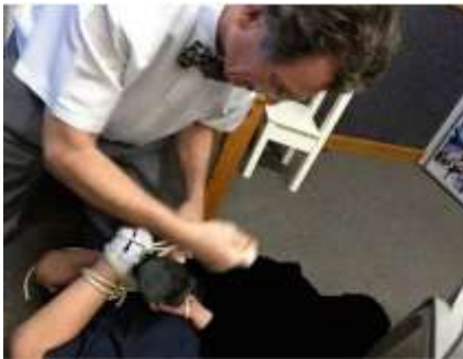
Doctor tying the autistic child

Isn’t it normal for doctors to support colleagues? The Medical Board of Queensland heard the awful case of a doctor who hog-tied a boy in his office (that is, tied the child’s hands and feet together behind his back). The Mum took a photo of it.