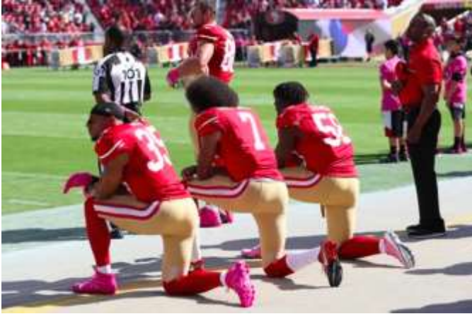
San Francisco 49ers “taking a knee” -- refusing to stand during the national anthem

An Adelaide mum whom we will call Barbara is opting to boycott, sidestep, or otherwise protest the corruption of the Family Court by not showing up at the upcoming trial of her case. Isn't that marvelous!