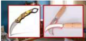
Curved knife still in use