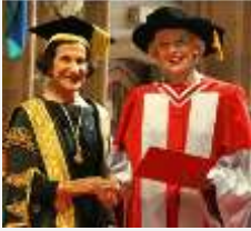
(R) Dame Quentin Bryce, Governor General (L) Dame Marie Bashir, b 1930, psychiatrist, violinist, Patron NSW police