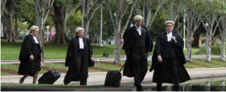
Photo of prosecutors