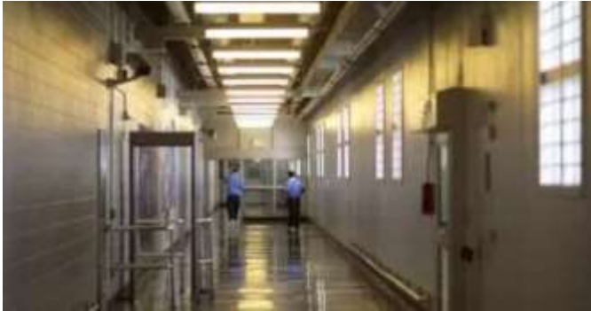
An unusually clean-looking prison

So what is the issue this book deals with? It is the practice of taking children from a good parent or parents and involving them in some kind of sexual activity (and sometimes torture, though I have avoided that topic). The foregoing 15 chapters presented arguments, respectively, on these 15 points: