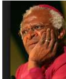
Anglican Archbishop Tutu of Cape Town

“Between 1980 and 1991, the Republic of El Salvador in Central America was engulfed in a war which plunged Salvadorian society into violence, left it with thousands and thousands of people dead and exposed it to appalling crimes, until the day, 16 January 1992, when the parties, reconciled, signed the Peace Agreement and brought back the light and the chance to re-emerge from madness to hope. Violence was a fire which swept over the fields of El Salvador; it struck at justice and filled the public administration with victims; and it singled out as an enemy anyone who was not on the list of friends. Violence turned everything to death and destruction, for such is the senselessness of that breach of the calm plenitude which accompanies the rule of law....”