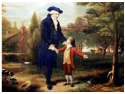
"Dad, about that cherry tree...."

It is essential for kids to be trained in truth-telling. This is because lying is normal. We all lie, a lot. Anything listed in the Ten Commandments is something humans want to do -- hence the commands to stop doing it. Plus, there are secular punishments.