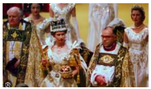
Coronation of QEII in 1953, Photo: RadioTimes.com

Equity! Oh, those were the days! In England, for centuries prior to the Judicature Act of 1873, there were the regular courts of law and, separately, a Court of Equity. In that court, the king could bend the law a bit to fit unusual circumstances of a case. He could make "constructive remedies." He could also order persons to "disgorge their ill-gotten gains." Just imagine Bill Gates disgorging now.