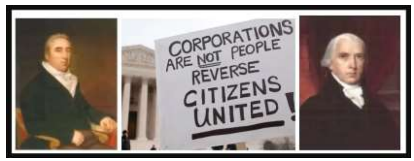
(L) William Marbury (C) Poster, Photo: rollcall.com (R) James Madison

Did the Framers of the US Constitution in 1787 genuinely wrack their brains to come up every possible power-constraining mechanism for citizens to use against an evil government? One huge omission at the Philadelphia Convention was the Founders' failure to raise the question: What if a few Americans become so wealthy that they can control government by bribes? Admittedly, they mentioned 'bribery' as a cause for impeaching presidents and other officers, but what all impeachers (members of Congress' lower house) got bribed out of their minds?