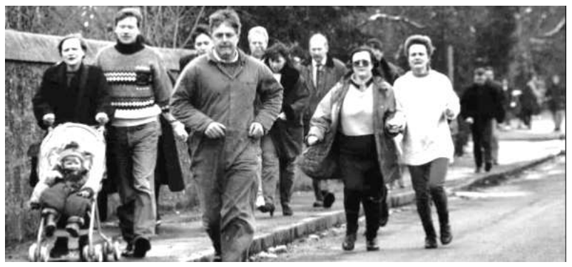
Dunblane parents rushing to find their kids after a real shootout in 1996:

6. Soto-Remington/Bushmaster case is suspicious. Connecticut's law, CUTPA, provided a way around the federal law that makes gunmakers immune. When Soto sued, Bushmaster made an offer of $33 mil and declared bankruptcy -- without asking for discovery.