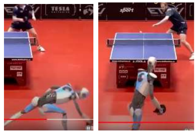
AI robots taking over ping pong

The robot shown above never gets it wrong. He has been programmed to hit the incoming ball, which he can "see." He must twist his hand, arm, back, knee, ankle, etc, to position his body the same way you or I would, in order to send the ball back. He can't be using his cerebrum, since he ain't got one. He is using only motor programs. What about the human on the opposite side of the table? He has a cerebrum -- just this morning he was trying to decide whether to re-mortgage his house! But during most ping-pong moves, his motor cortex does the work.